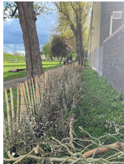
Left: Some of our volunteers starting the planting in January 2023. Middle: It's all starting to leaf up now that April has arrived. Right: Planting and fencing finished for now – until we start again in October! Article by Gill Cawdron